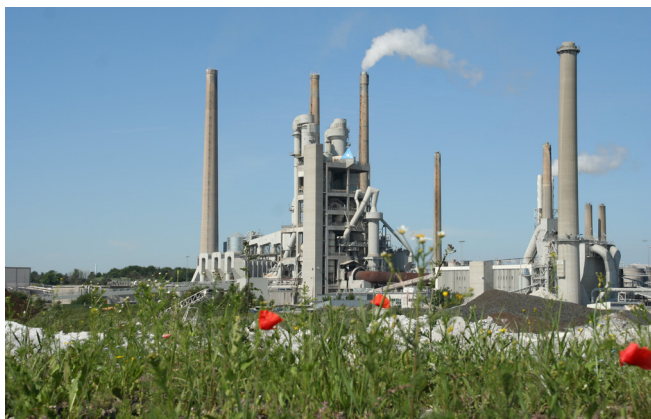
Aalborg Portland – plant Rørdal in Denmark.

Sustainability and decarbonisation must guide our day-by-day operations, and we want to be in the driver's seat.